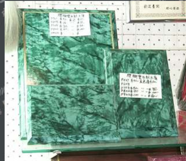
Particle Board Finished in Green Marble Style