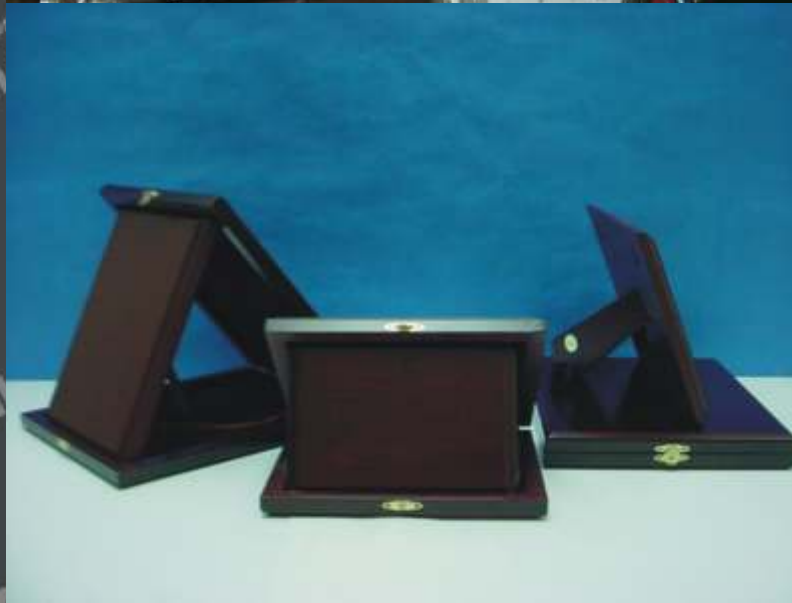
Stained Particle Board