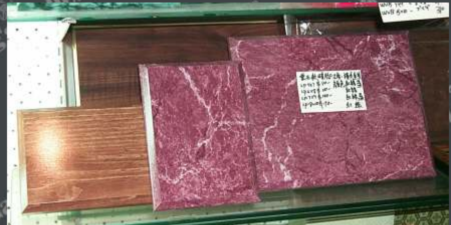
Natural Solid Wood Particle Board Finished in Rose Marble Style